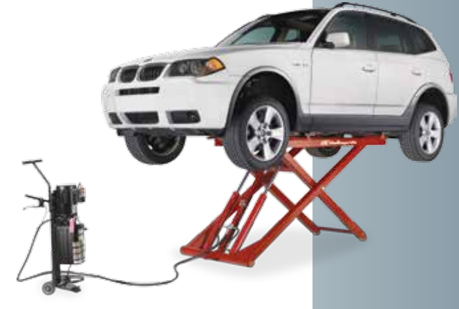
Model#: MR6 Portable Mid-Rise Lift 6,000 lb. capacity

Exclusive features include a sliding/rotating arm design with rubber pads, low drive-over clearance, and much more.